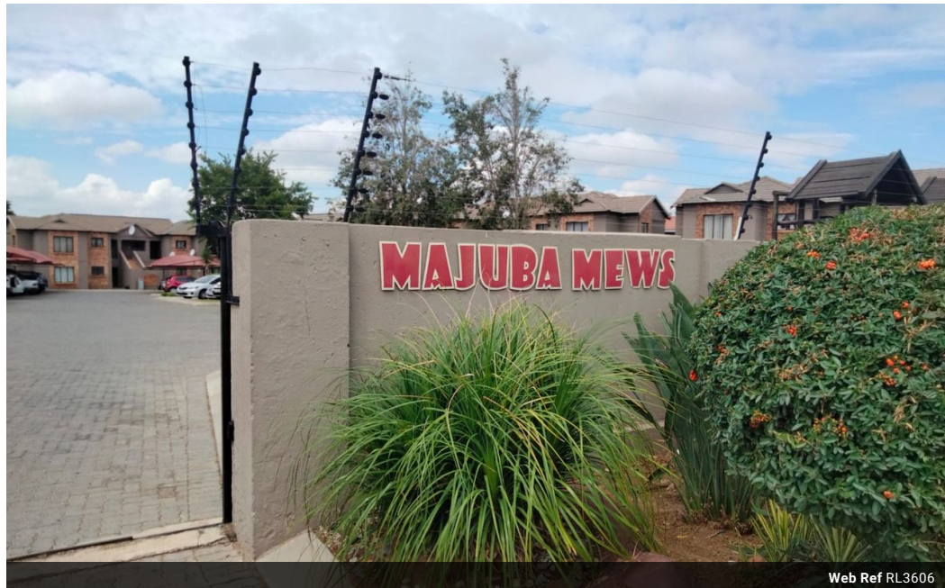
Web Ref RL3606

Entrance 9, Gleneagles Office Park, Koorsboom Ave, Glen Erasmia x22, Kempton Park, 1619