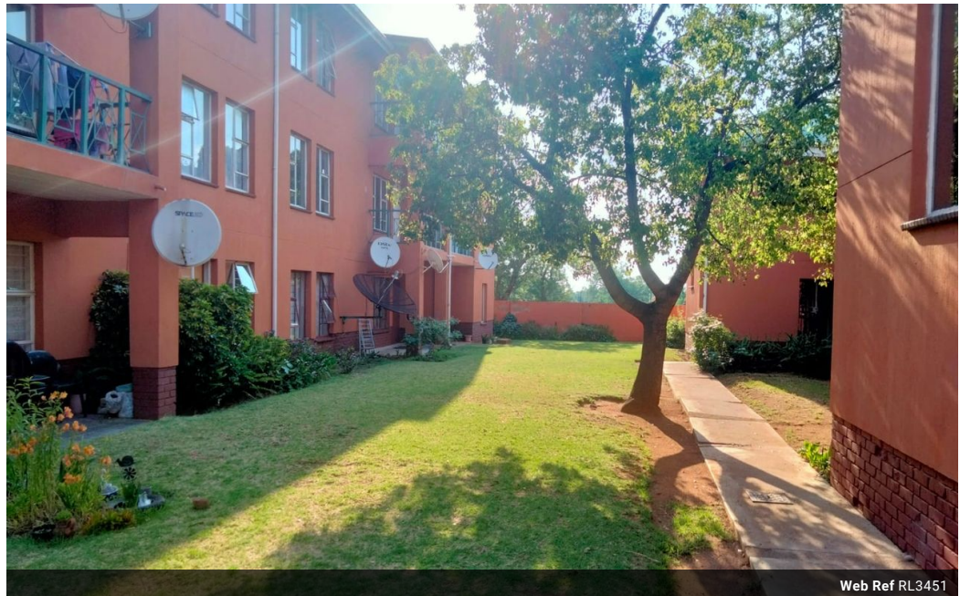
Web Ref RL3451

Entrance 9, Gleneagles Office Park, Koorsboom Ave, Glen Erasmia x22, Kempton Park, 1619