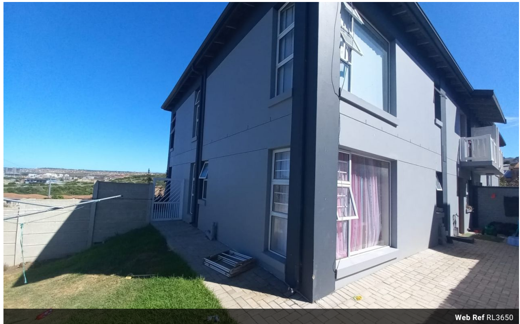
Web Ref RL3650

Entrance 9, Gleneagles Office Park, Koorsboom Ave, Glen Erasmia x22, Kempton Park, 1619