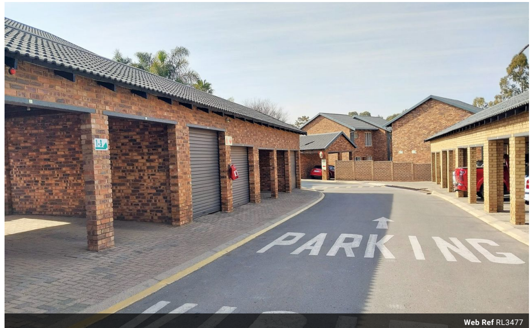
Web Ref RL3477

Entrance 9, Gleneagles Office Park, Koorsoom Ave, Glen Erasmia x22, Kempton Park, 1619