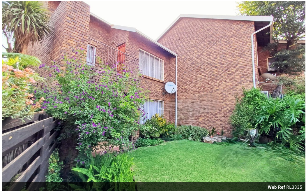
Web Ref RL3335

Entrance 9, Gleneagles Office Park, Kooersboom Ave, Glen Erasmia x22, Kempton Park, 1619