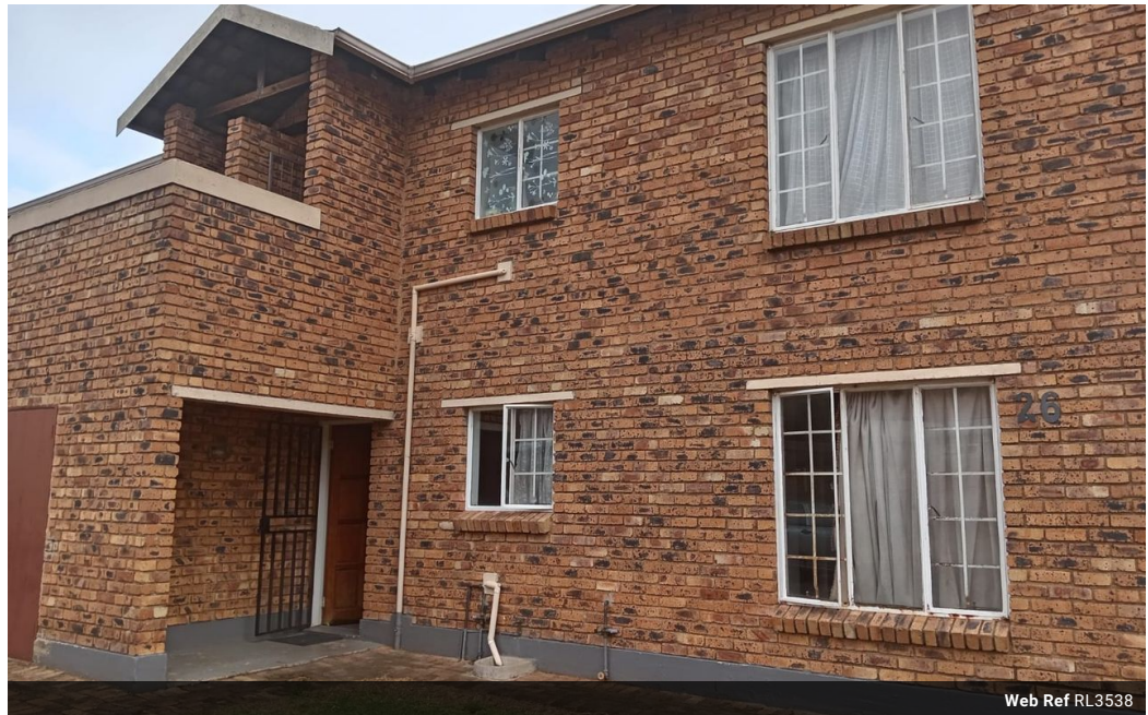
Web Ref RL3538

Entrance 9, Gleneagles Office Park, Koorsboom Ave, Glen Erasmia x22, Kempton Park, 1619