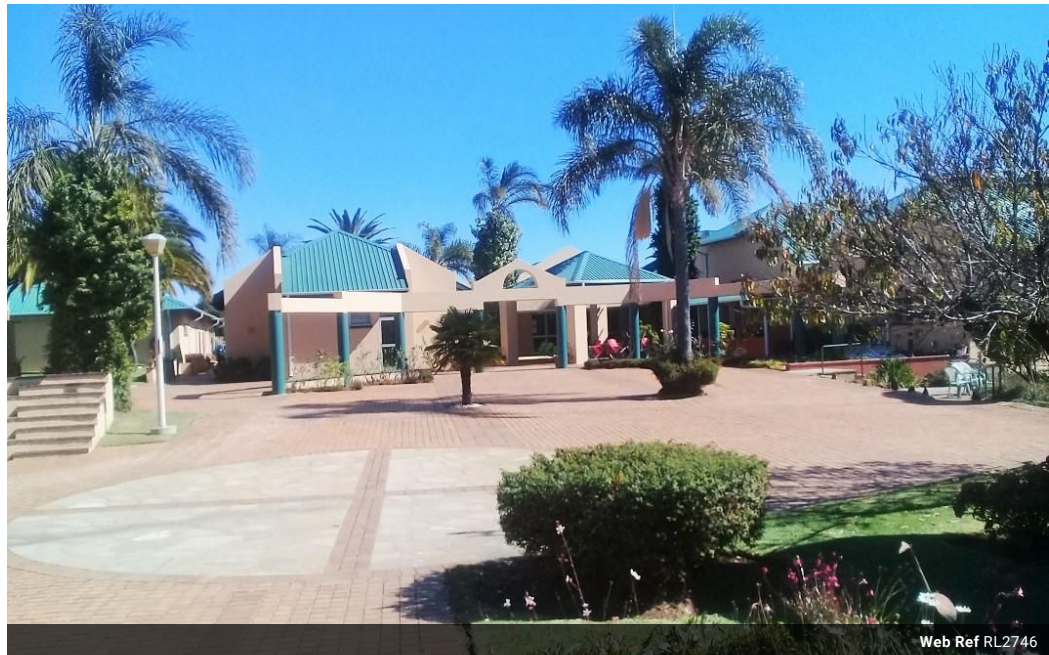
Web Ref RL2746

Entrance 9, Gleneagles Office Park, Kooersboom Ave, Glen Erasmia x22, Kempton Park, 1619