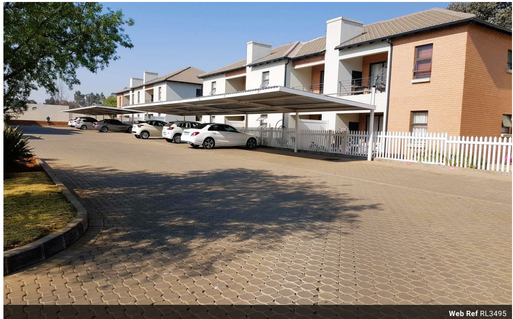
Web Ref RL3495

Entrance 9, Gleneagles Office Park, Koorsboom Ave, Glen Erasmia x22, Kempton Park, 1619