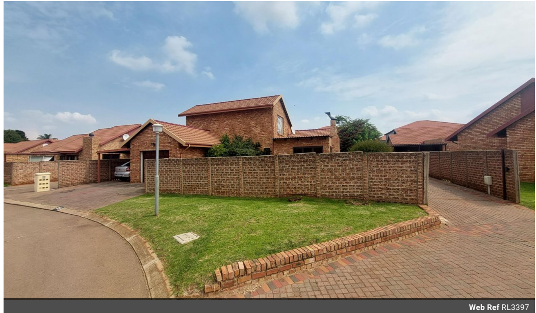
Web Ref RL3397

Entrance 9, Gleneagles Office Park, Koorsboom Ave, Glen Erasmia x22, Kempton Park, 1619