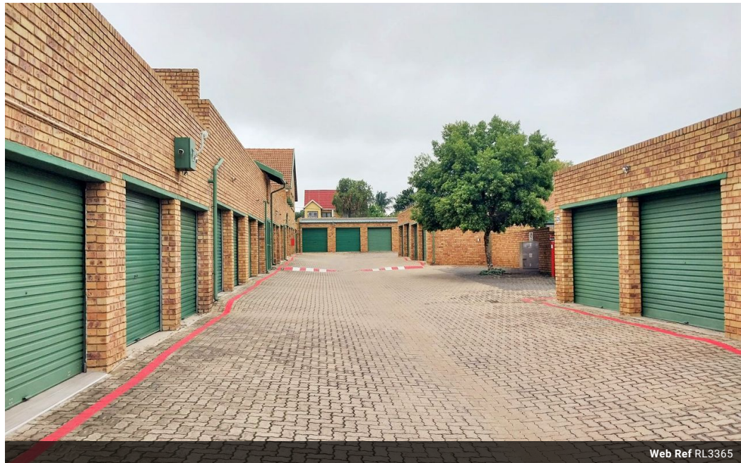
Web Ref RL3365

Entrance 9, Gleneagles Office Park, Kooersboom Ave, Glen Erasmia x22, Kempton Park, 1619