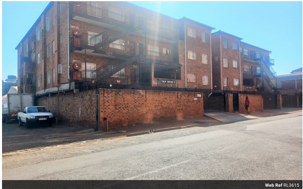
Web Ref RL3615

Entrance 9, Gleneagles Office Park, Kooersboom Ave, Glen Erasmia x22, Kempton Park, 1619