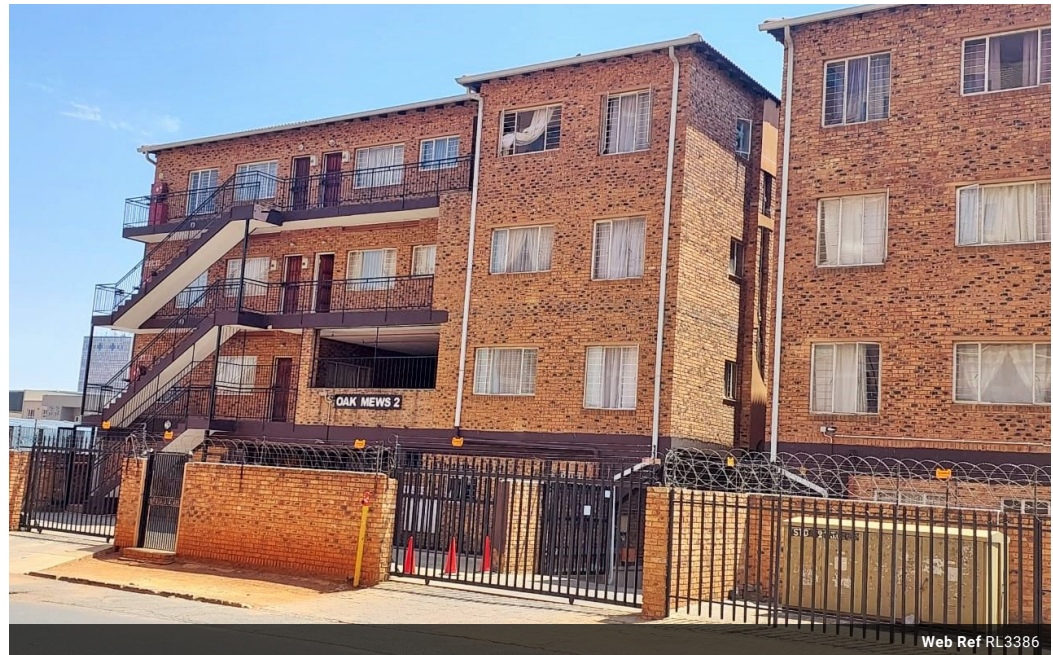
Web Ref RL3386

Entrance 9, Gleneagles Office Park, Kooersboom Ave, Glen Erasmia x22, Kempton Park, 1619