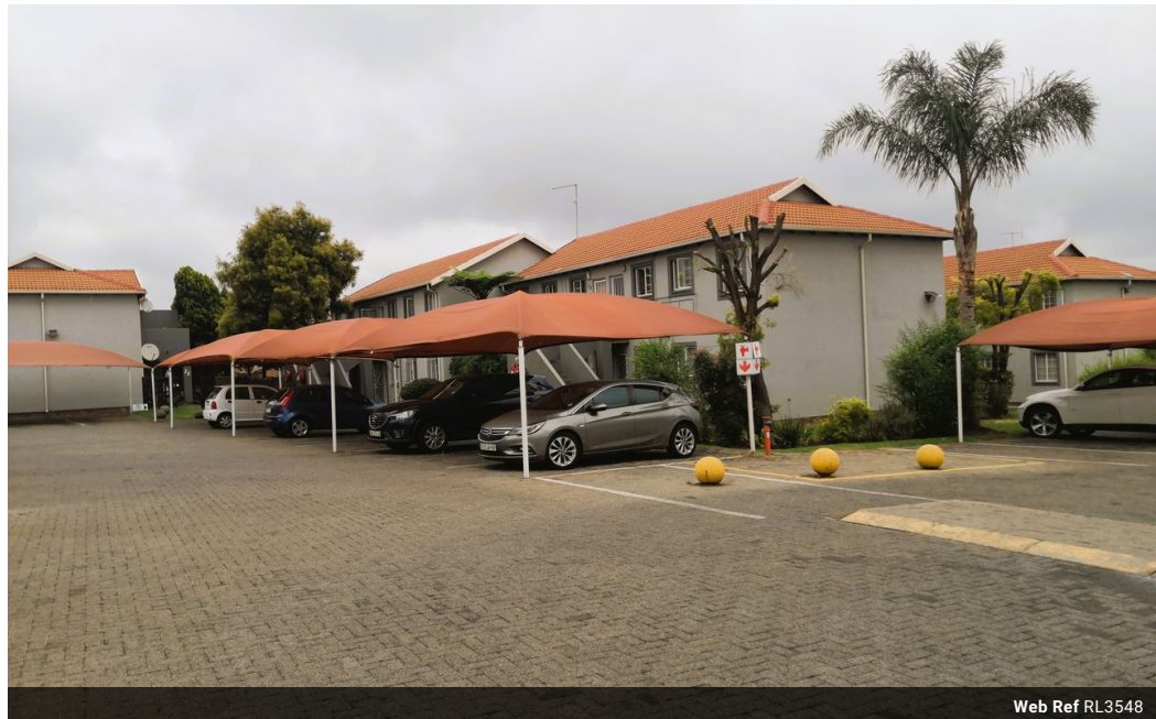
Web Ref RL3548

Entrance 9, Gleneagles Office Park, Koorboom Ave, Glen Erasmia x22, Kempton Park, 1619