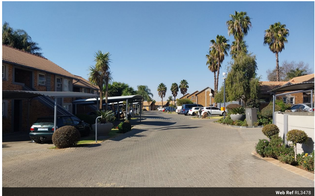
Web Ref RL3478

Entrance 9, Gleneagles Office Park, Koorsoom Ave, Glen Erasmia x22, Kempton Park, 1619