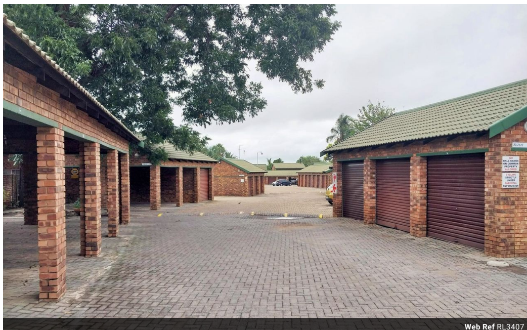
Web Ref RL3407

Entrance 9, Gleneagles Office Park, Koorsoom Ave, Glen Erasmia x22, Kempton Park, 1619