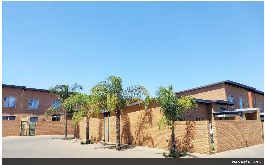
Web Ref RL3282

Entrance 9, Gleneagles Office Park, Koorsoom Ave, Glen Erasmia x22, Kempton Park, 1619