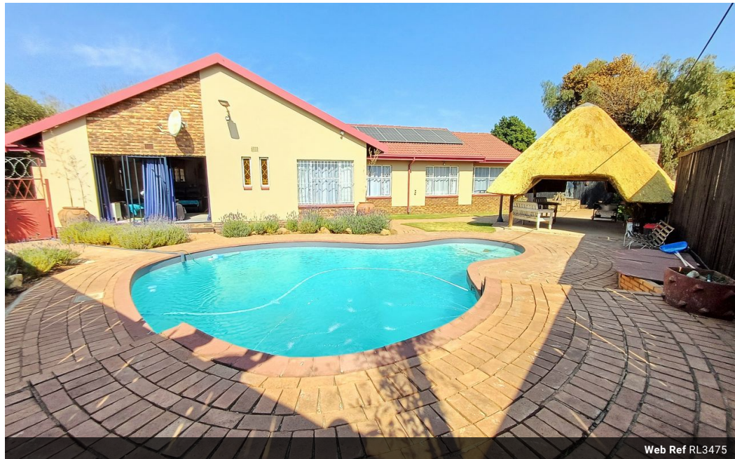
Web Ref RL3475

Entrance 9, Gleneagles Office Park, Kooersboom Ave, Glen Erasmia x22, Kempton Park, 1619