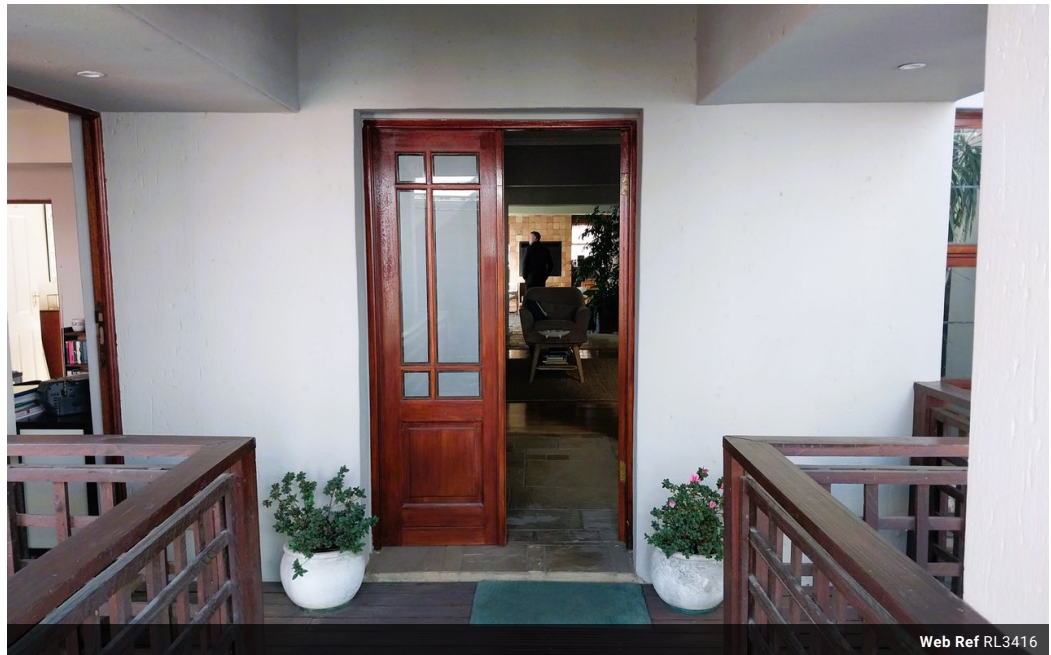
Web Ref RL3416

Entrance 9, Gleneagles Office Park, Koorsboom Ave, Glen Erasmia x22, Kempton Park, 1619