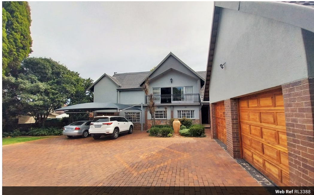
Web Ref RL3388

Entrance 9, Gleneagles Office Park, Koorboom Ave, Glen Erasmia x22, Kempton Park, 1619