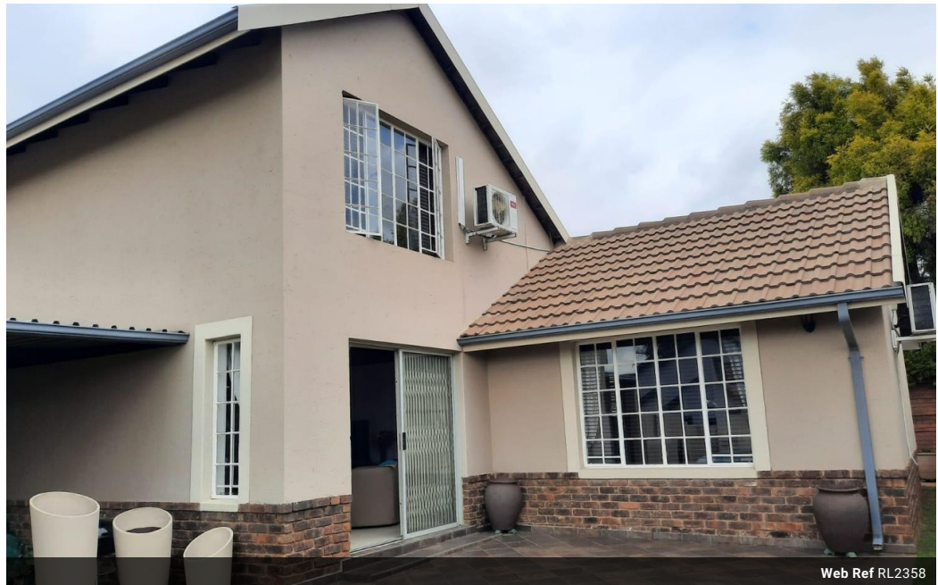
Web Ref RL2358

Entrance 9, Gleneagles Office Park, Koorsboom Ave, Glen Erasmia x22, Kempton Park, 1619