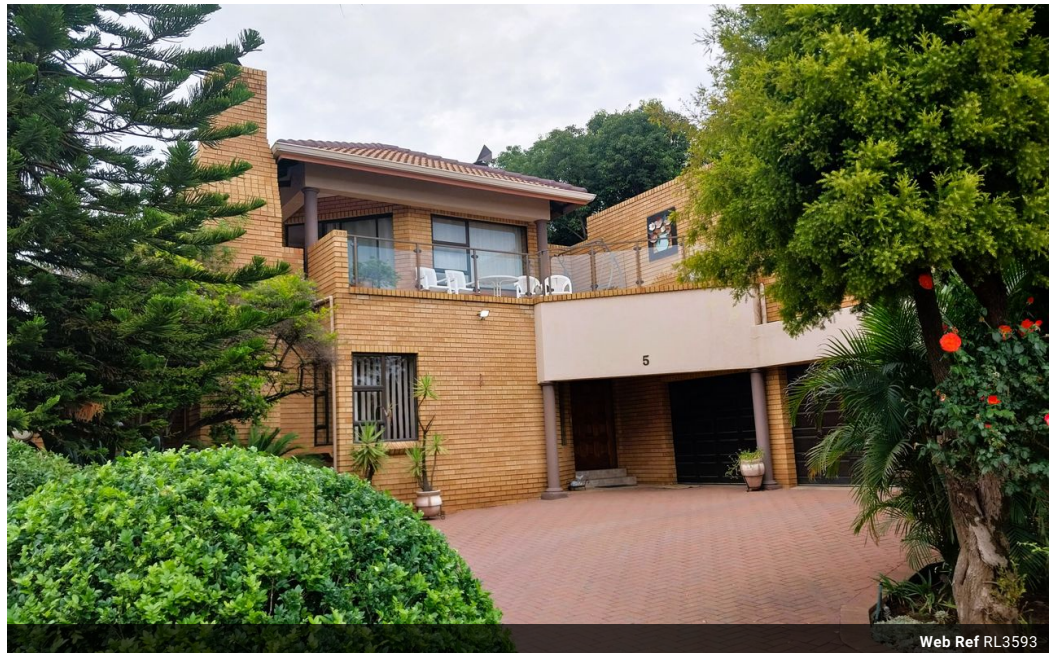
Web Ref RL3593

Entrance 9, Gleneagles Office Park, Koorsoom Ave, Glen Erasmia x22, Kempton Park, 1619