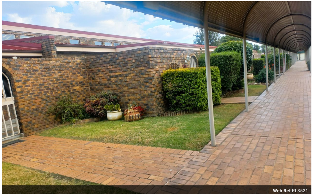
Web Ref RL3521

Entrance 9, Gleneagles Office Park, Koorsboom Ave, Glen Erasmia x22, Kempton Park, 1619