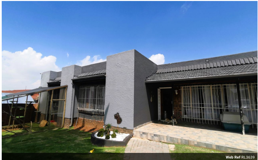
Web Ref RL3639

Entrance 9, Gleneagles Office Park, Koorsboom Ave, Glen Erasmia x22, Kempton Park, 1619