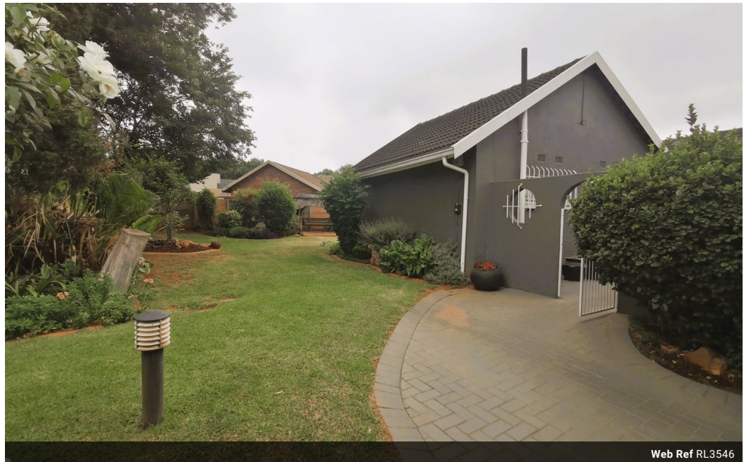
Web Ref RL3546

Entrance 9, Gleneagles Office Park, Koorboom Ave, Glen Erasmia x22, Kempton Park, 1619