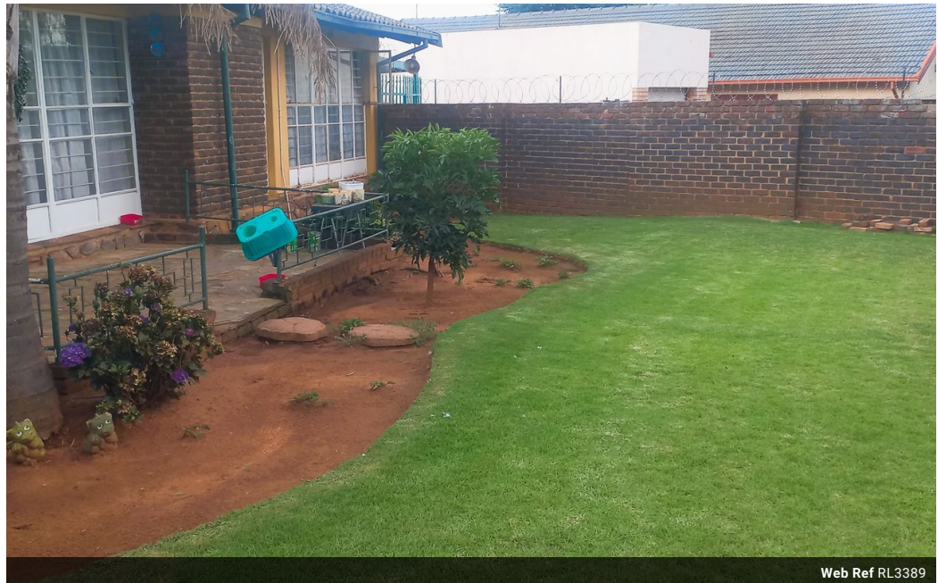
Web Ref RL3389

Entrance 9, Gleneagles Office Park, Koorsboom Ave, Glen Erasmia x22, Kempton Park, 1619