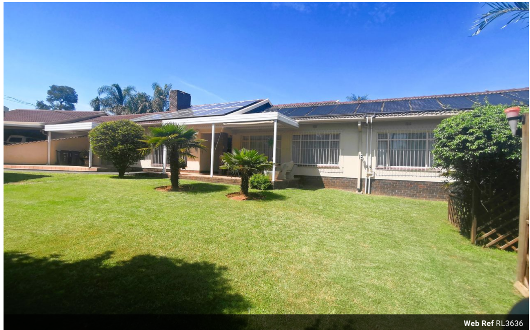
Web Ref RL3636

Entrance 9, Gleneagles Office Park, Koorsboom Ave, Glen Erasmia x22, Kempton Park, 1619