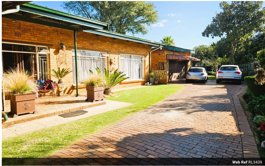
Web Ref RL3439

Entrance 9, Gleneagles Office Park, Koorsboom Ave, Glen Erasmia x22, Kempton Park, 1619