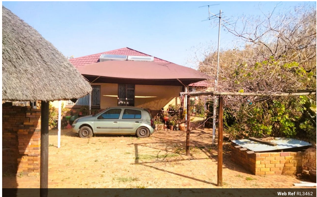
Web Ref RL3462

Entrance 9, Gleneagles Office Park, Koorsboom Ave, Glen Erasmia x22, Kempton Park, 1619