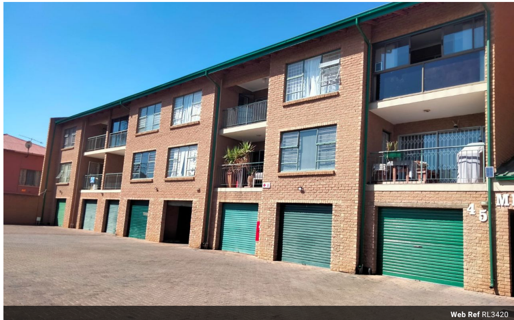
Web Ref RL3420

Entrance 9, Gleneagles Office Park, Koorboom Ave, Glen Erasmia x22, Kempton Park, 1619