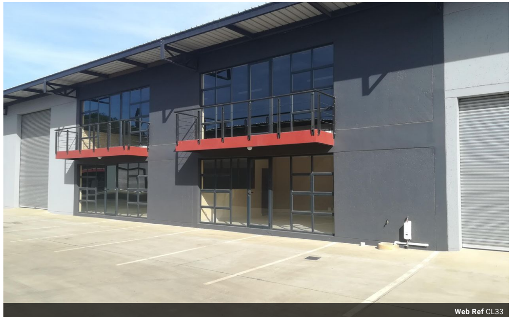
Web Ref CL33

Entrance 9, Gleneagles Office Park, Koorsboom Ave, Glen Erasmia x22, Kempton Park, 1619