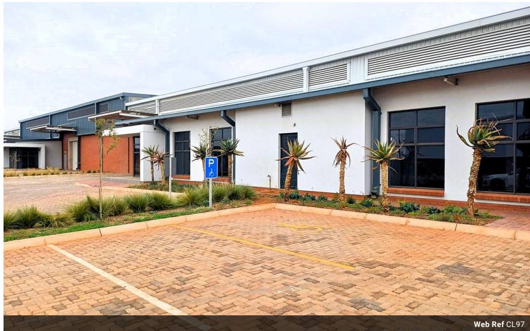
Web Ref CL97

Entrance 9, Gleneagles Office Park, Koorsboom Ave, Glen Erasmia x22, Kempton Park, 1619