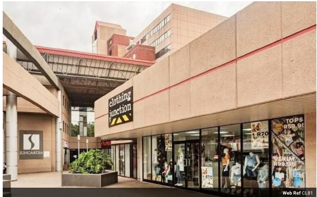
Web Ref CL81

Entrance 9, Gleneagles Office Park, Koorsboom Ave, Glen Erasmia x22, Kempton Park, 1619