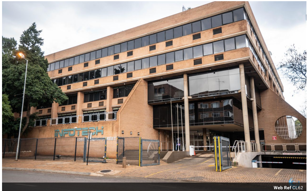
Web Ref CL62

Entrance 9, Gleneagles Office Park, Koorsboom Ave, Glen Erasmia x22, Kempton Park, 1619