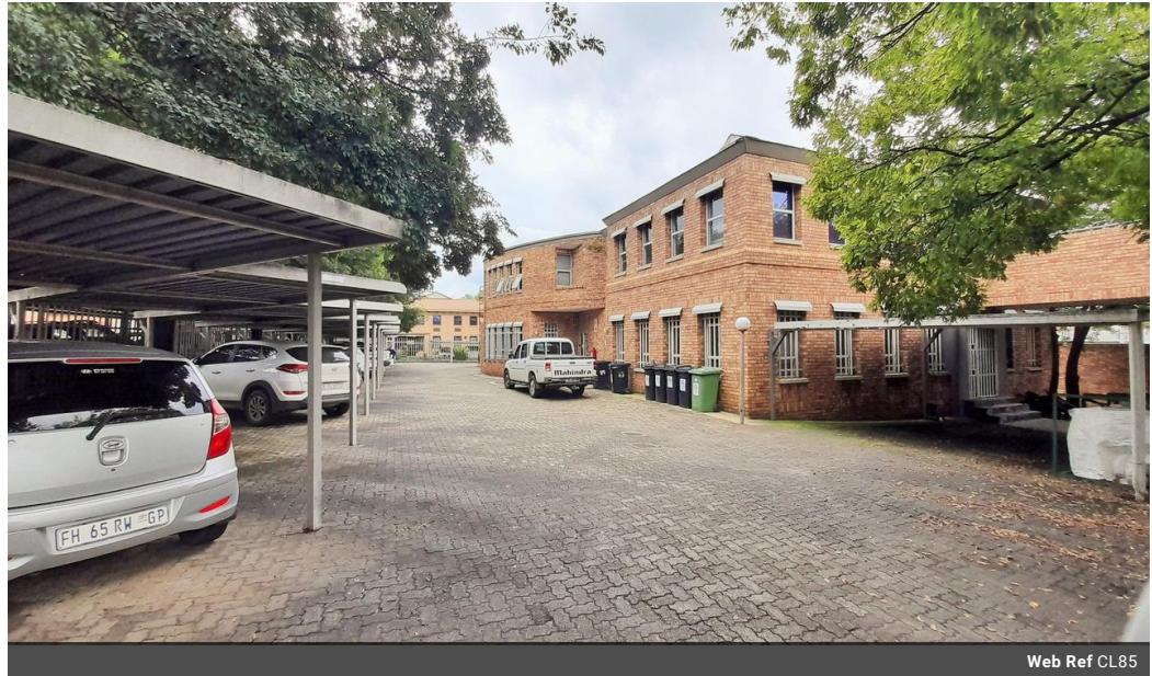
Web Ref CL85

Entrance 9, Gleneagles Office Park, Koorsboom Ave, Glen Erasmia x22, Kempton Park, 1619